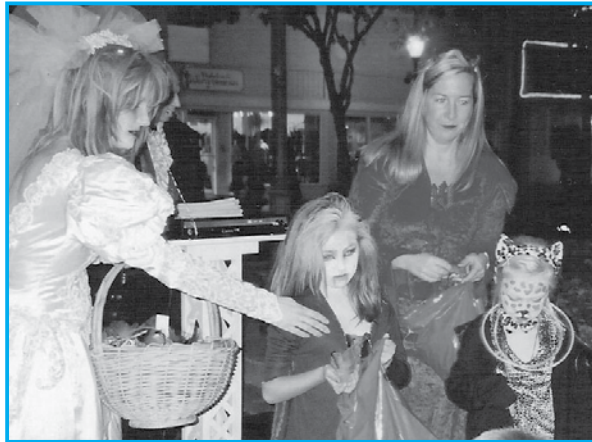
Children and adults had fun dressing up for the Safe Trick or Treat 2006 Event.